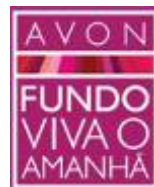
Avon Fund "Long Live Tomorrow" - Brazil