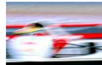
Speed Museum Project - Brasília, DF