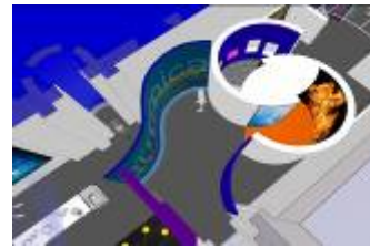
Children's Museum Project - Chemistry Room - São Paulo, SP