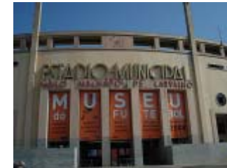
Football Museum Project - Science Room - São Paulo, SP