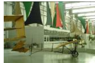
Museum Wings of a Dream Museographic Project - São Carlos, SP