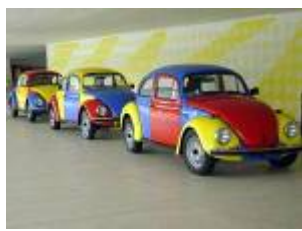
Raw Material - Curitiba, 2002