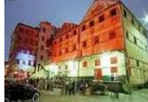
American Capital of Culture - Curitiba, 2003