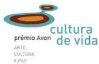
Avon Prize Culture of Life- Brazil