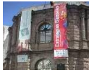
Baroque strategies – Contemporary Brazilian Art - Quito, Equator, 2004