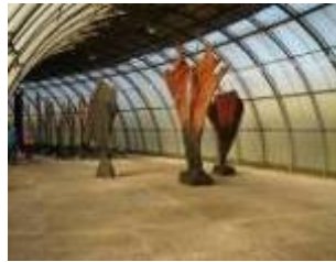
Frans Krajcberg Cultural Space – Art and Environment – Curitiba, 2003