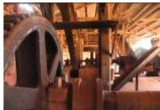
Sugar Cane Museum Project - Central Mill, Sertãozinho, SP