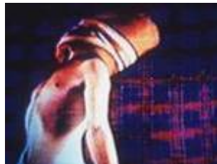
Graphic Exhibition - Curitiba, 2003