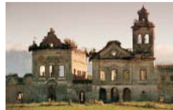
Exhibition Center of Comperj (Petrobras) - Itaboraí, RJ