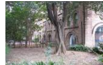
Museum of Brazilian TV Project - São Paulo, SP